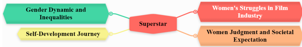
Figure 5 Superstar Film Themes