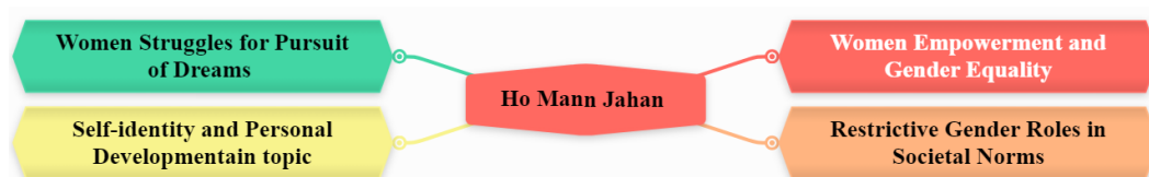
Figure 1 Ho Mann Jahan Film Themes

Ho manna Jahan film was mainly focus on self-identity and personal growth. It is positively portrayed that how the quest of self-realization among women brings developments at every scale by challenging the societal norms particularly gender based and also exponent the personal freedom and individual growth. It stresses on the need of women progress in creative arts and overcoming traditional constraints for them.